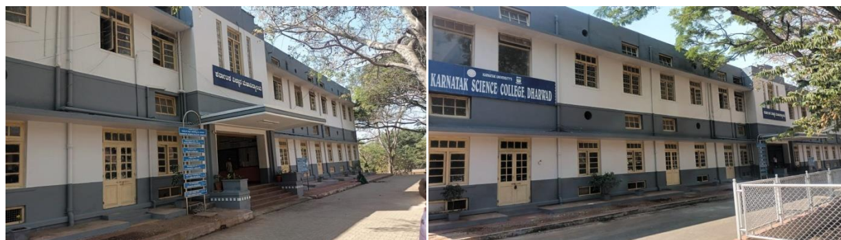
Picture 4 a & b. The main building of Karnatak Science College, Dharwad containing the Principal's Chamber, the college office and the Departments of Chemistry (UG & PG) and Geology.