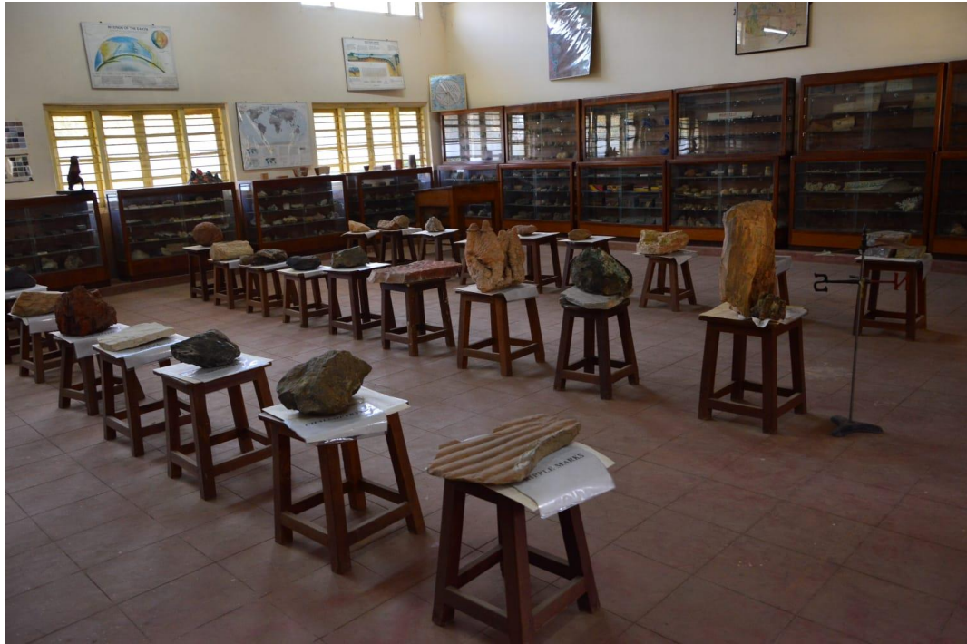
Picture 6. Photograph of the Geology museum, KSCD