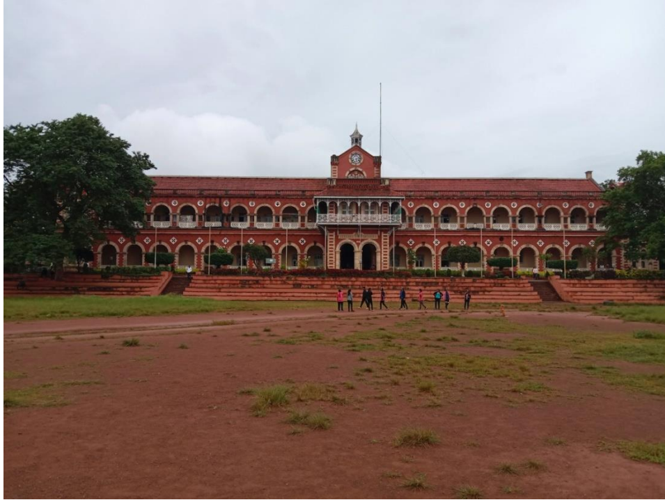
Picture 20. The iconic red building of KCD, with the cricket and athletics playground in front of it. The building presently houses the Principal's chamber, the administrative wing (office) and lecture halls of KACD.