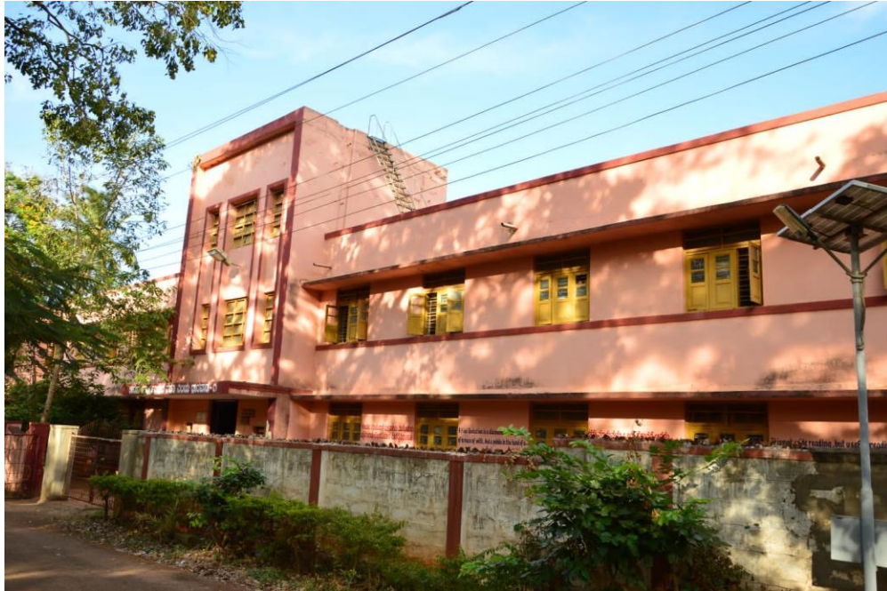
Picture 10. The Kaveri Hostel (Building 1) for residence of Girl students belonging to KSCD and KACD