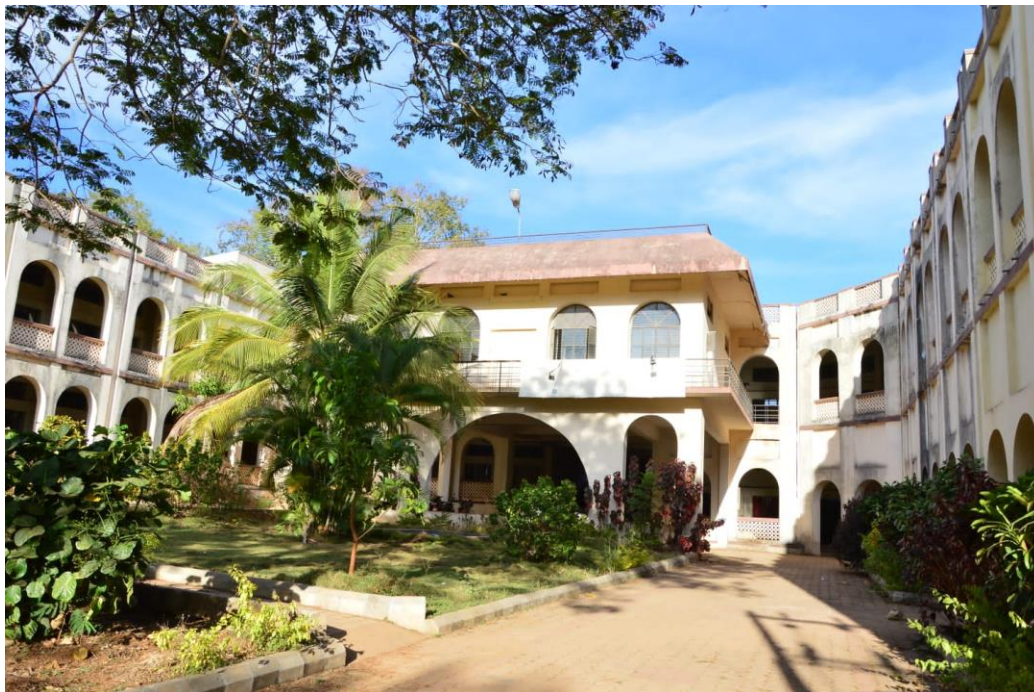
Picture 19. A view of the Department of Computer Science at KSCD