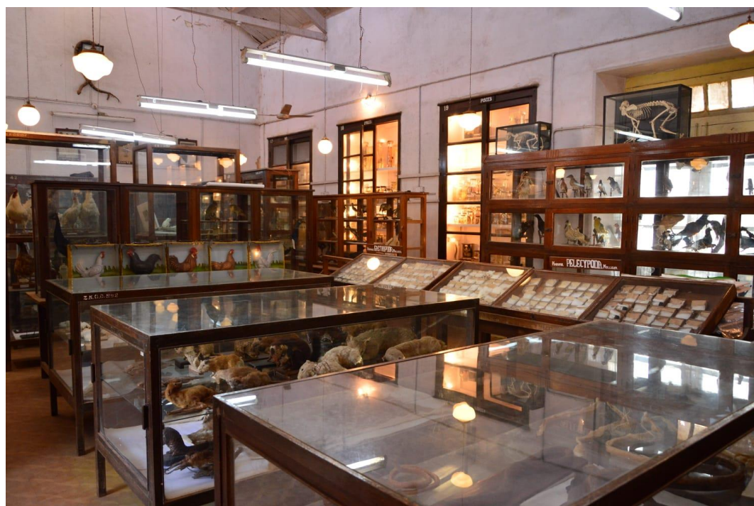
Picture 5. Photograph of the Zoology museum, KSCD