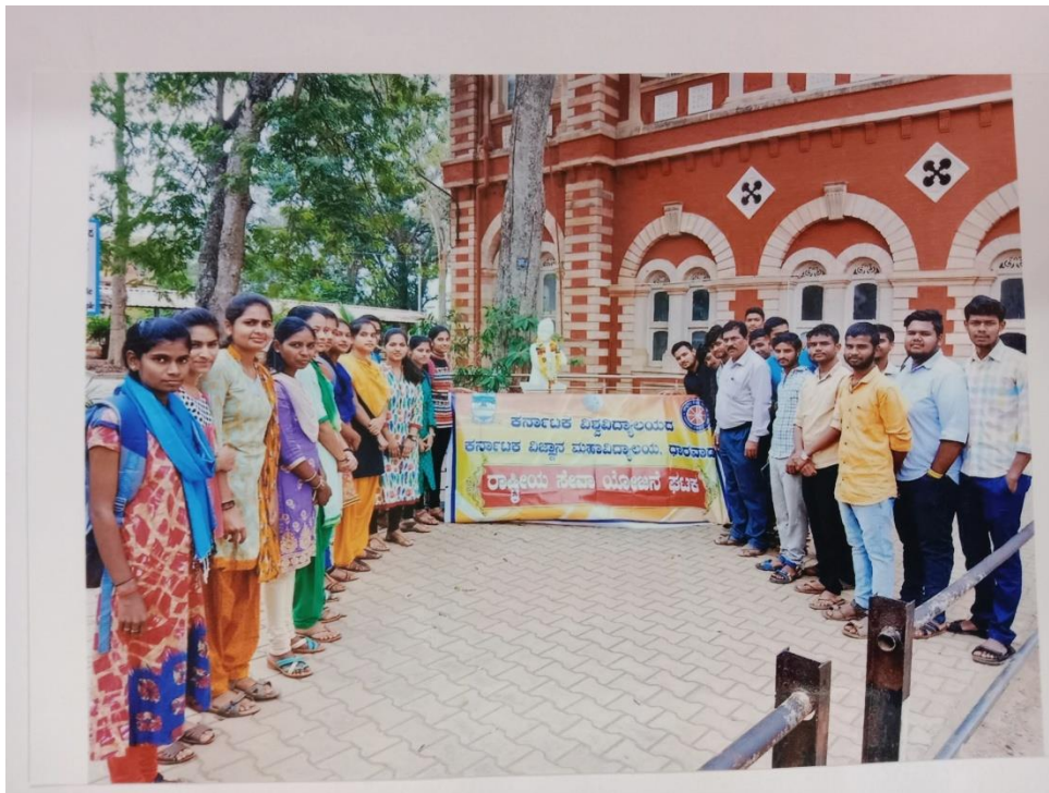
Picture 21. The NSS unit of KSCD is quite active and has organized many activities both within the campus and outside it (extension activities)