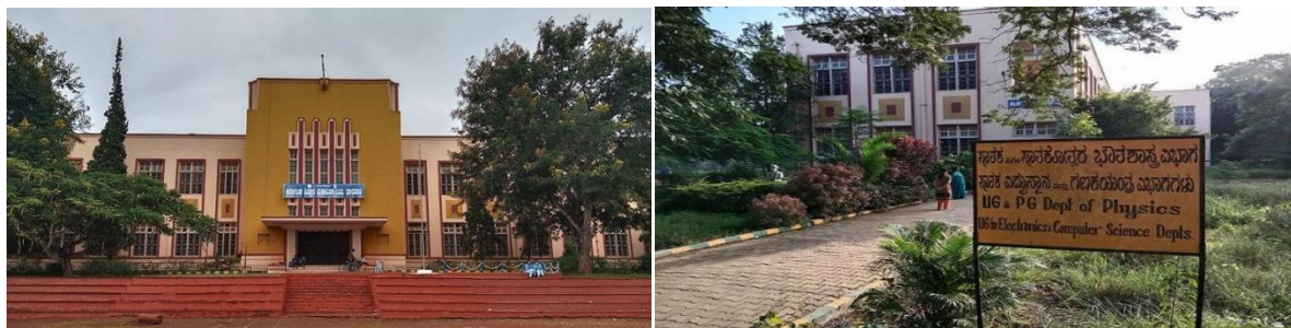
Picture 1 a & b. The UG & PG Department of Physics (and Electronics) is housed in a stately building with the football ground in front, and facing the KCD main road.

The Karnatak Science College, Dharwad (KSCD) is a constituent college of the Karnatak University, Dharwad (KUD). It is the one of the oldest colleges existing in Dharwad City of North Karnataka in India, and located on a hillock with a conspicuous and stately red building (presently containing the administrative portions and lecture halls of Karnatak Arts College, Dharwad). The college (KSCD) is well known as KCD Science College, retaining the brand name "KCD", the famous abbreviation of the undivided Karnatak College, Dharwad which was established on 20 th June 1917. The staff members of the college, students and the public of Dharwad fondly and gratefully remember the efforts of the founders of KCD, namely, Late Shri. Diwan Bahadur Srinivas Rao Rodda, Late Shri. Rao Bahadur Rudragouda Artal, Late Shri. M. B. Choubal as well as Sir Siddappa Kambali for establishing the Karnatak College in Dharwad, and for ensuring its survival during difficult times.