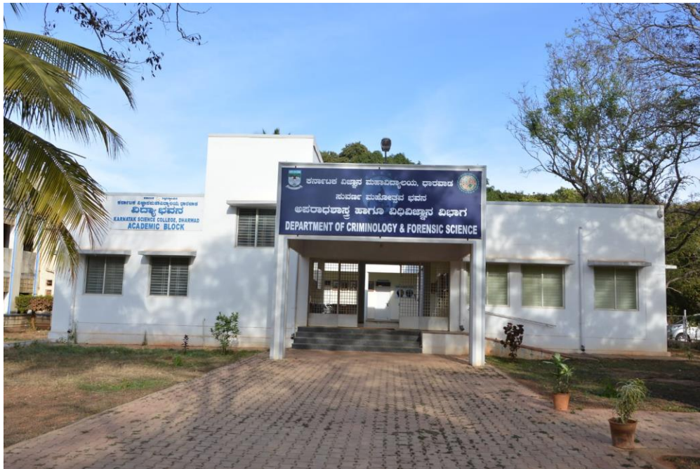
Picture 11. The Academic Building, hosting the Department of Forensic Science, KSCD