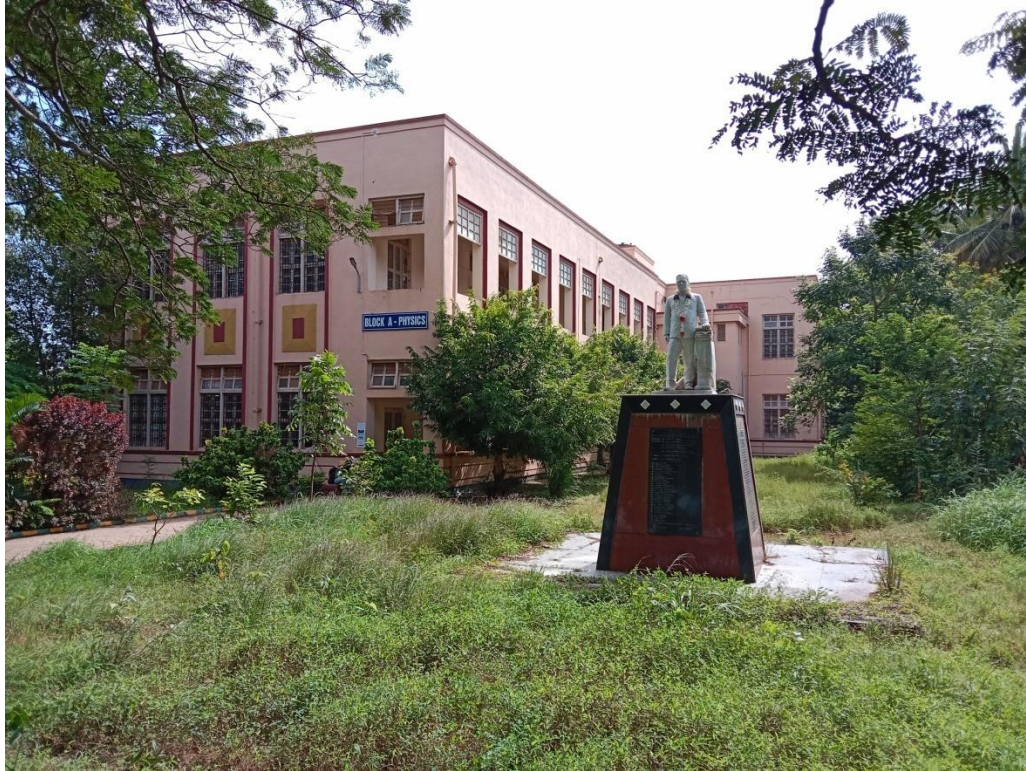
Picture 18. The side-view of UG & PG Department of Physics, KSCD