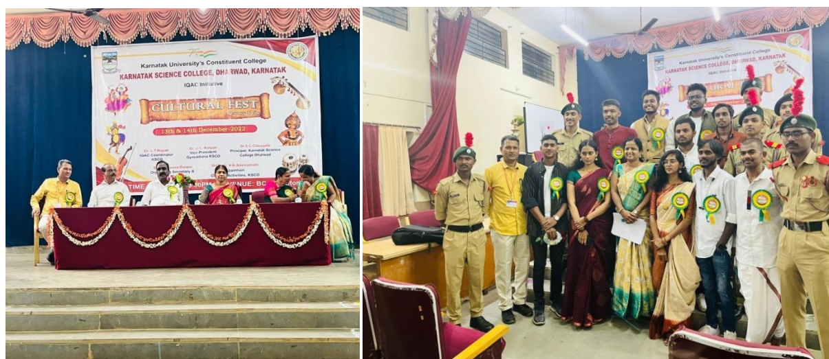
Picture 3. One of the outlets for the students of Karnatak Science College, Dharwad to exhibit their talents is through their participation in the Cultural Fest.