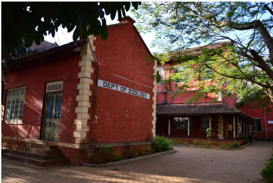
Picture 7. The Department of Zoology, KSCD