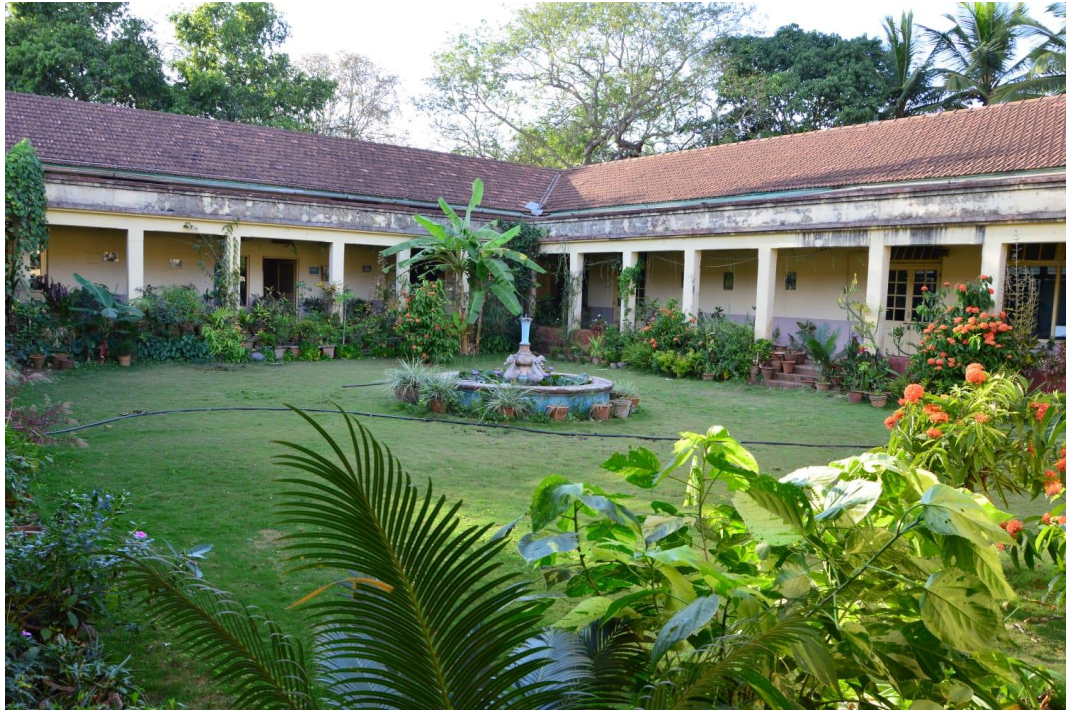
Picture 8. A view from the Department of Botany, KSCD