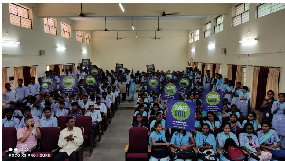
Picture 14. A program on "Save Soil" was held in KSCD in the BCA auditorium on 23-06-2022, with the enthusiastic participation of faculty members and UG students of the college