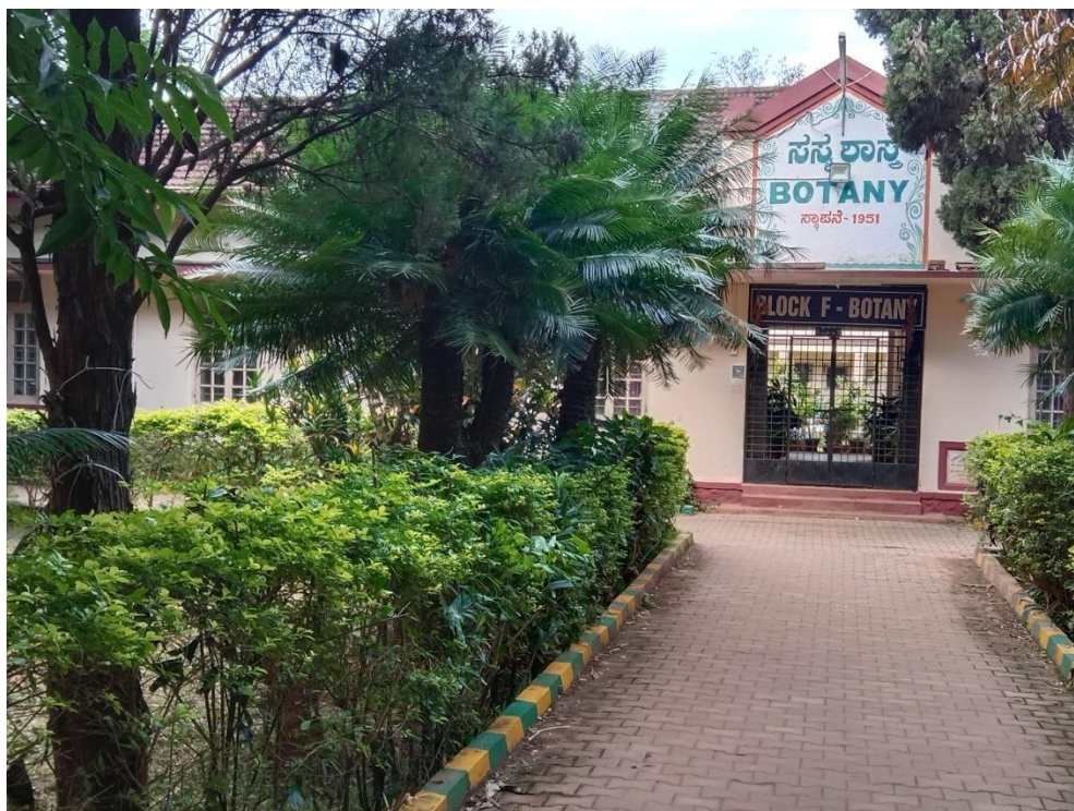
Picture 16. A view of the Department of Botany, KSCD